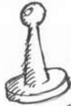
GAME PINS 6-8 Colors